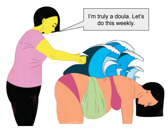
Don't let this mnemonic misguide you-GLP analogs should not be used during pregnancy.

Dulaglutide (Trulicity) is a GLP analog that reduces hemoglobin A1C by 1.5% to 1.8%, which is slightly more than other GLP analogs. Like other -glutides, dulaglutide is proven to reduce risk of cardiovascular events. Expect a weight loss of 2.5-4.6 kg (5.5-10 pounds) at the maximum dose of 4.5 mg SC weekly.