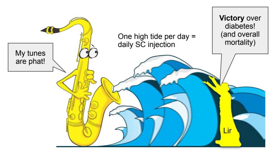
Lir is a sea god in Irish mythology.

Saxenda <u>reduces risk of developing type 2 diabetes</u> in individuals taking it for weight loss.